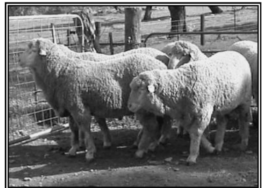
Photos taken 13 th August, 2009 Sale Rams